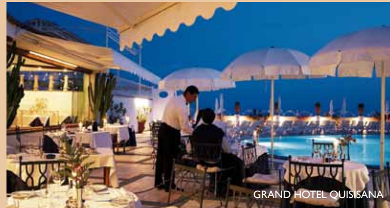
GRAND HOTEL QUISSANA

Centrally located just steps from Capri's main piazza and its fashionable boutiques, this high-society escape has been welcoming visitors since 1845. Now it's a member of 'The Leading Hotels of the World' and, whilst it's definitely stately, is also decidedly serene, its manicured lawns, circular pool and exceptional spa echoing its early life as a sanitarium ('Quissana' means 'Here we heal'). All 148 rooms and suites are classically appointed; private terraces and stunning sea views readily available. And whilst regional dishes and classic fare are presented on the poolside terrace and in the Rendez-Vous restaurant, it's not until you've taken your seat in the gastronomic venue that you realise this is somewhere that takes hotel-keeping very seriously.