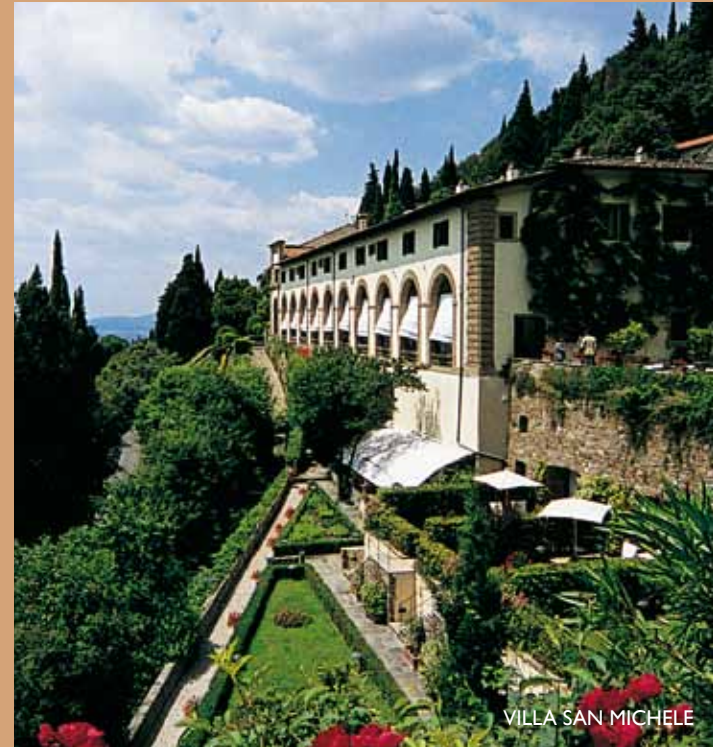
VILLA SAN MICHELE

Today Florence is a thriving metropolis with fashionable eateries, Gucci-clad citizens and, of course, its very own non-stop rush hour. Yet this regional capital of Tuscany is also Italy's 'Renaissance City' and so will be forever linked with 15th century artists such as Michelangelo, Botticelli and Leonardo da Vinci. Its skyline is thankfully still a masterpiece courtesy of showpieces like the Renaissance Basilica, Giotto's Campanile and the Gothic Duomo; all of these architectural treasures enhanced by the fast-flowing Arno River and romantic Ponte Vecchio. But if you really want to immerse yourself in Florence's art and culture don't leave without wandering through the Uffizi Gallery; a visit to the Accademia also recommended if you fancy marvelling at Michelangelo's Statue of David. And why not use this fascinating city as a base from which to explore the entire Chianti region, the towns of Sienna and Pisa all within easy driving distance?