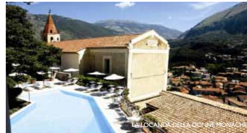
LA LOCANDA DELLA DONNE MONACHE