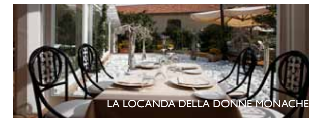
LA LOCANDA DELLA DONNE MONACHE

This former convent is tucked away in the picturesque old village of Maratea – its 18th century origins can still be discerned in the whitewashed walls, uneven tiled floors and raw stone walls. Yet today it comes with lashings of style (all those virginal white fabrics are very 'now'), not to mention an eclectic range of contemporary oils, Murano glass and bronze sculptures. Just 27 uniquely-styled guest rooms are on offer here, ranging from the almost nun-like Classic Rooms to the more hedonistic suites with their canopy kingsize beds and heady views over the rooftops. And you can certainly kick austerity into touch in Il Sacello restaurant, the Italian cuisine drawing from the fresh seafood and flavours of Basilicata.