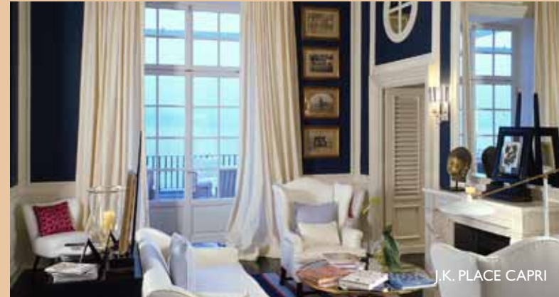
J.K. PLACE CAPRI