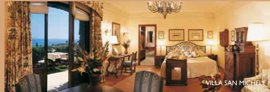
VILLA SAN MICHELE

This 15th century monastery was transformed into one of the world's most romantic getaways by Orient-Express Hotels in the 1980s. Of course, the company had a particularly good start – the hotel's façade is attributed to Michelangelo, whilst its setting high in the hills of Fiesole yields stunning vistas over Florence and the Arno Valley. Nowadays it offers 46 guest quarters, some of them secluded suites in the gardens and a few of them the cosy hideaways of former monks, yet others are 'named' suites with anything from private gardens to pool-like bathtubs. The Tuscan cuisine of the 16th century Loggia restaurant and umbrella cocktails of the hilltop swimming pool are perfectly enhanced by the spellbinding views.