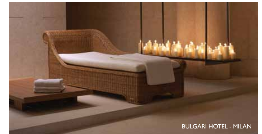
BULGARI HOTEL - MILAN

The perfect base from which to 'do' Milan, the Bulgari Hotel boasts a faultless location just minutes away from the Via Montenapoleone, the Via della Spiga, La Scala and Brera. And as you would expect from this renowned jewellery company, the hotel that bears its name is also the epitome of elegance and chic. The original building dates back to the 18th century and comes with its own 4,000 sqm. private garden which is a real rarity in Milan. Yet inside the design and furnishings are contemporary and bold; the 58 guest rooms sumptuous yet intimate, the spa (complete with mosaic-tiled pool) totally decadent, and the decidedly smart and modern restaurant attracting an equally smart and modern clientele.