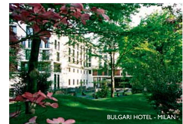
BULGARI HOTEL - MILAN