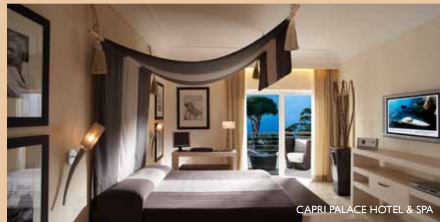
CAPRI PALACE HOTEL & SPA